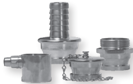
British Instantaneous fittings