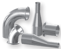
High Purity Biopharm fittings

Visit dixonvalve.com to order your copy of the 2011 Dixon Price List. Dixon: The Right Connection for quality, service and innovation.