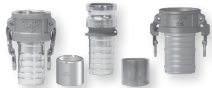
Cam and Groove Crimp Style

Visit dixonvalve.com to order your copy of the 2011 Dixon Price List. Dixon: The Right Connection for quality, service and innovation.