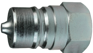
K6F6 - steel