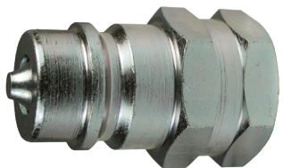
K4F4 - steel