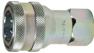
4KF4 - steel