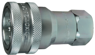
6KF6 - steel